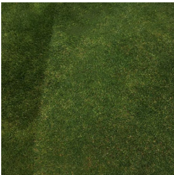
After 3 days

TerraTrakPlus tiles removed on grass pre-treated with TerraTect.