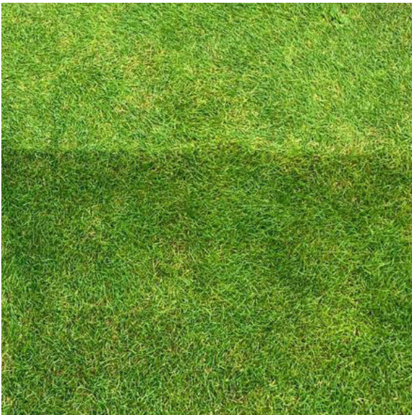
After 12 days