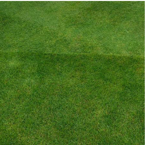
After 9 days